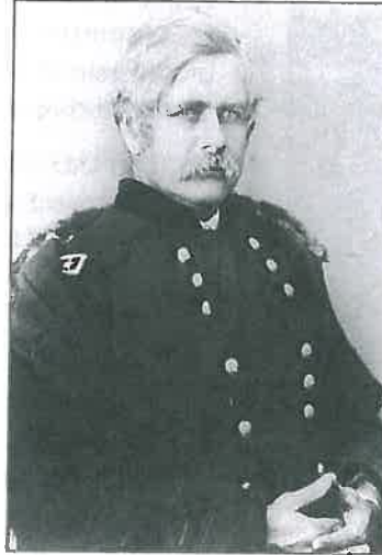
MAJ. GEN. EDWARD ORD