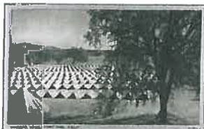
Unknown, "Bivouac area, Fort Ord, Calif.," CSUMB Library Digital Collections , accessed February 29, 2012, http://library2.csumb.edu/omeka/items/show/212 .