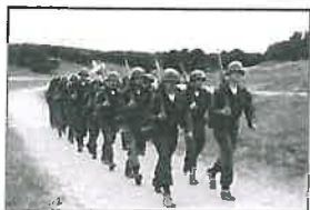
"Photograph of soldiers marching," CSUMB Library Digital Collections , accessed February 29, 2012, http://library2.csumb.edu/omeka/items/show/341 .