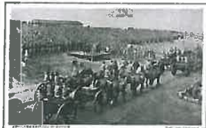
"Artillery passing in review,"