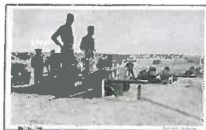
W.M. Smith, San Francisco, CA, "Machine guns, Fort Ord, California," CSUMB Library Digital Collections , accessed February 29, 2012, http://library2.csumb.edu/omeka/items/show/215 .