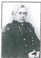
Unknown, "Major General Edward O.C. Ord," Library of Congress , accessed February 29, 2012, http://www.loc.gov/pictures/item/96514369/ .